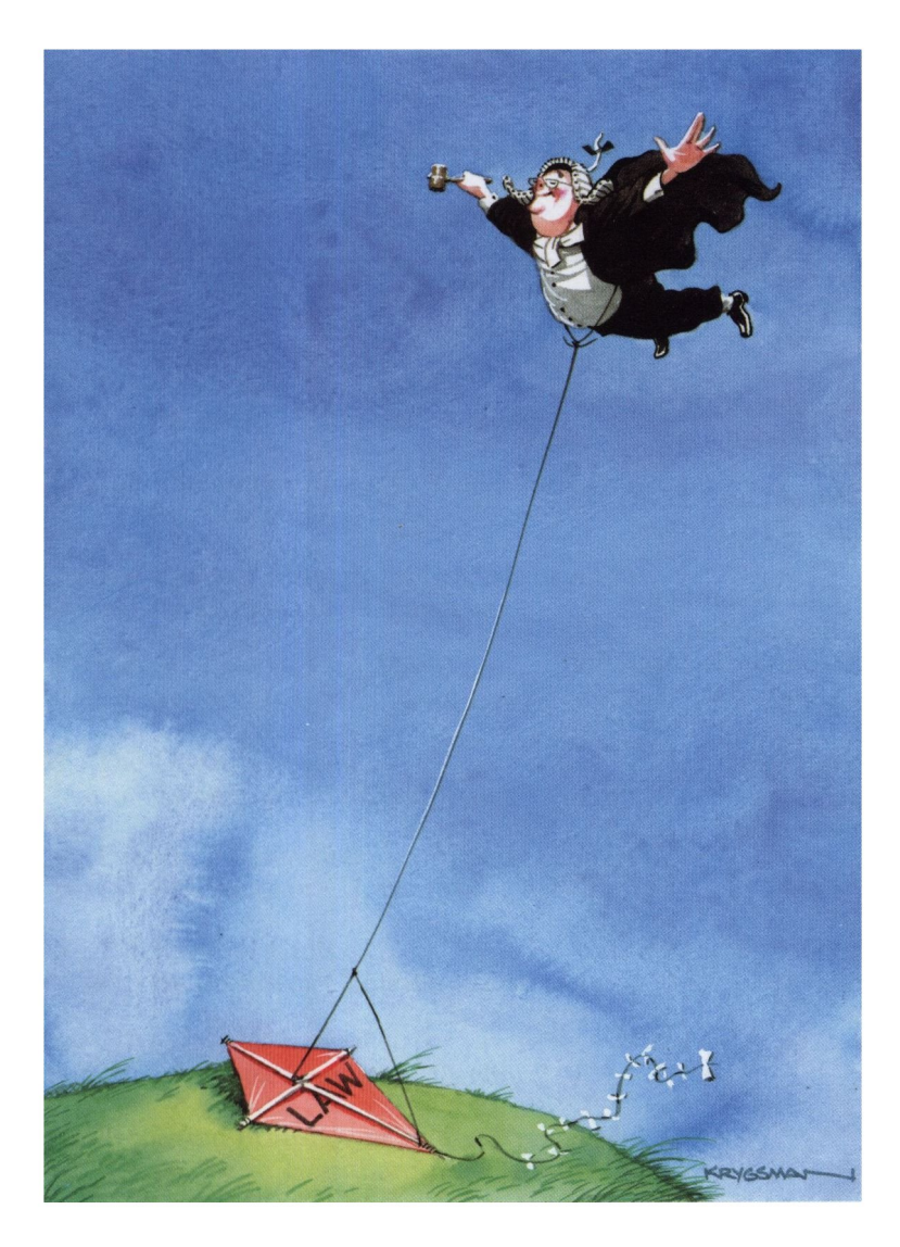
The above illustration is the work of Sturt Krygsman and was first published in The Australian newspaper, October 15, 2003. It is reproduced by permission of the artist and the original is now in the possession of the author.