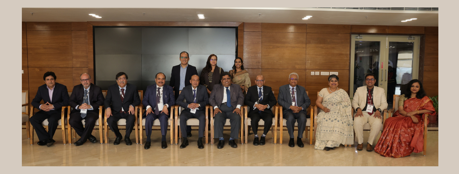
Members of the Organizing Committee, including Hon'ble Judges of the Delhi High Court, Core Group Bar members, Team, and Volunteers.